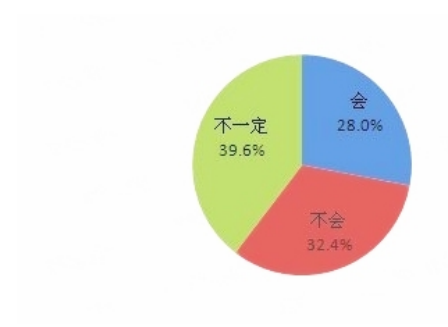
Figure 3: The mobile phone to access internet expection in coming year, results of a survey. The green part means "not sure", the red part means "no", the blue part means "yes". [7]