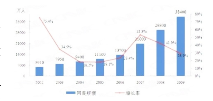
Figure 1: Number and growth rate of Internet users in China in 2009, horizontal axis is number (ten thousands), the red line is growth rate. [5]

The elderly use mobile phones to call family members and friends. However, they use seldom of other function except calling. The elderly sometimes want to find someone and play with them any time, and thus people who share the same interests, but they also find it difficult because of lack of information exchange, such as, they are not good at searching information and learning to use new software by internet.[9]